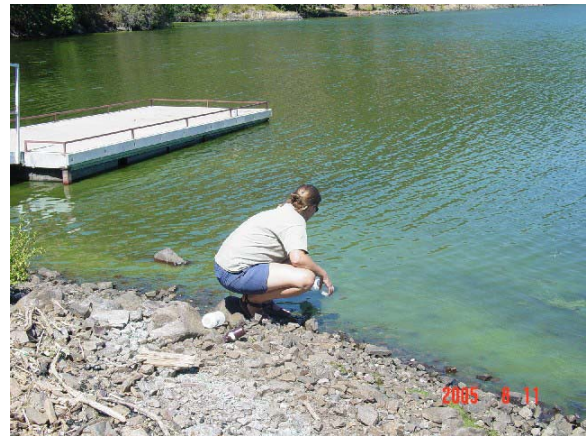
CRCC; 8-10-05 283,963 cells/ml Microcystis