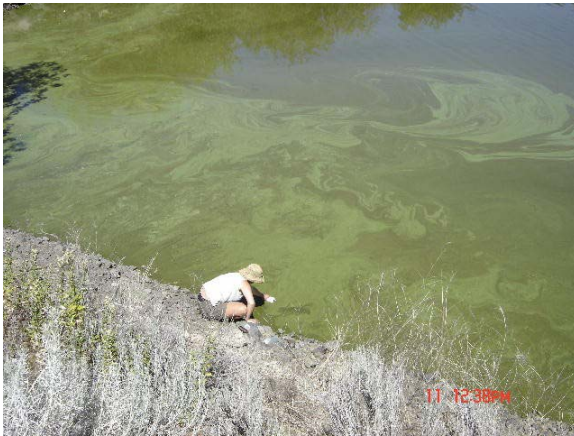
IRNC; 8-11-05 5,350,847 cells/ml Microcystis