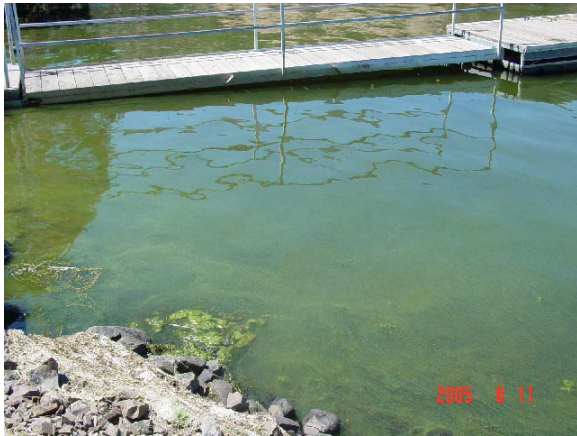
CRMC; 8-10-05 1,427,215 cells/ml Microcystis