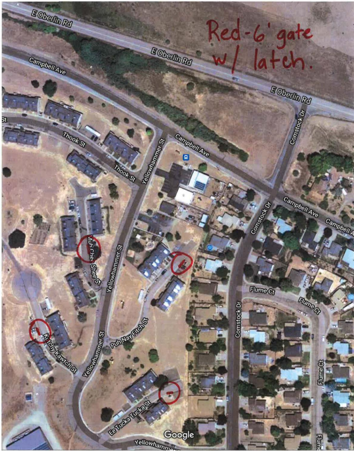
Imagery ©2022 Maxar Technologies, USDA Farm Service Agency, Map data ©2022 100 ft

https://www.google.com/maps/@41.7127325,-122.6224421,418m/data=!3m1!1e3