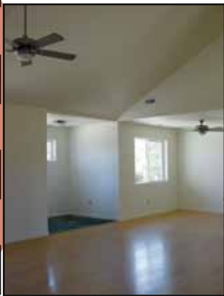
Above and Right: Living room and kitchen of one of the new homes in Yreka Housing