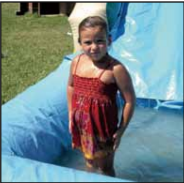
Just Staying Cool on the Waterslide!