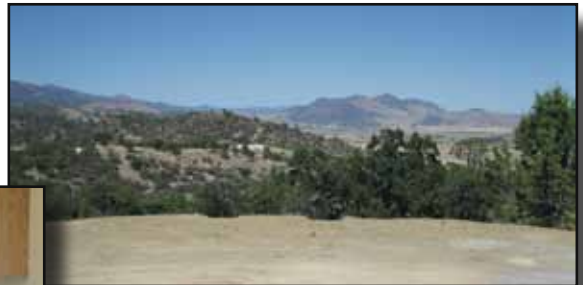
View from behind one of the new homes in Yreka Housing